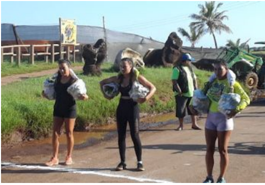
This was a relay race where you pass the bananas not a baton.