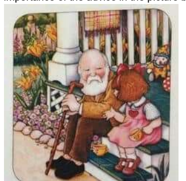
Time goes by fast, and people go in and out of your life so quickly, so you should never miss the opportunity to tell these people how much they mean to you.

Several events and dates converged this weekend to remind me of the importance of the advice in the picture below.