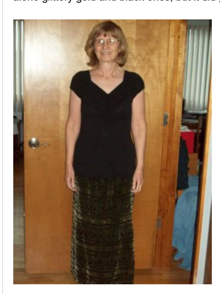
Oops, I forgot to take one picture. I also bought a "3 in 1" winter jacket for $35 (originally $140).

The top here is old, but I found the "Chicos" skirt at Goodwill for $3.75. I don't usually wear skirts, let alone glittery gold and black ones, but it did give me a boost of holiday spirit.