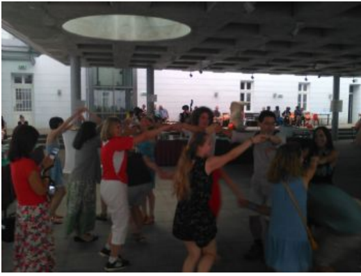
A bunch of guys spontaneously got together to do special steps in the middle