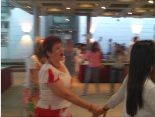
This is best described as repeated squat-kick. Good thing I got a lot of squat practice back home.