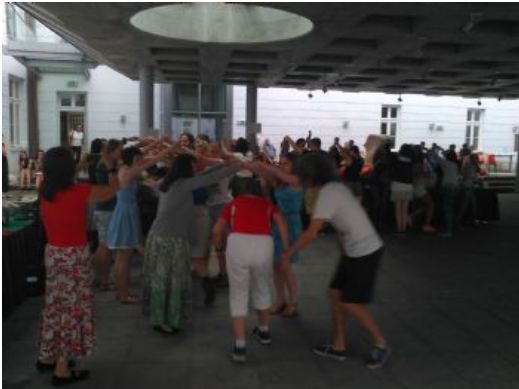
Lots of arm overhead while spinning around individually