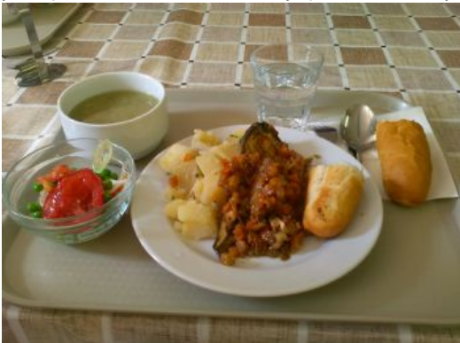
A typical lunch in the school cafeteria. I chose the stuffed eggplant with broccoli soup, salad and roll. Oh yeah, potatoes too. There are always potatoes, in every form imaginable.