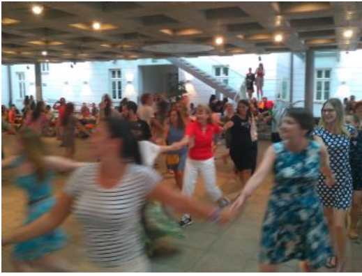
Yes, EVERYONE participated. This lady is the director of the whole summer program