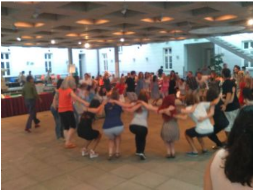
Here's my rear end with my right hand holding tightly to a 25 year old Italian guy