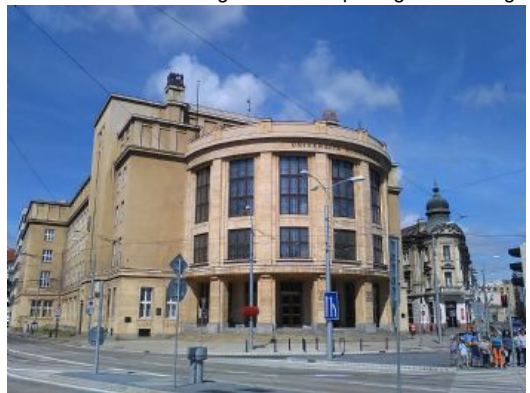
This is the building where our classes are held

This is the main building where the opening and closing ceremonies are held.